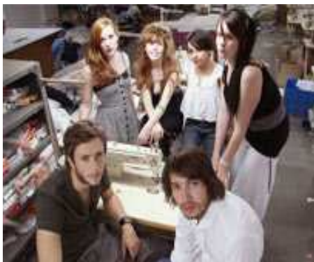
Stacey Dooley (centre) and friends

Stacey Dooley likewise both appeared in the documentary, 'Blood, Sweat and T-