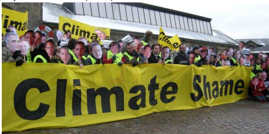
Campaigners at Copenhagen—December 2009

The Commission hopes this kind of meeting will take place across the diocese, and is preparing a brief film of the event for the diocesan website, to encourage others to hold their own meetings (available, we hope, by Easter). As fieldworker I have spoken at 10 of the 22 deaneries across the diocese, to ask if they will hold similar meetings. We are linking up with CAFOD and Progressio to reach more people. We have prepared an energy audit for parishes so that they can check how much carbon is actually being used – you can't shrink the footprint if you don't know how big it is! We have talked to the diocesan finance committee,