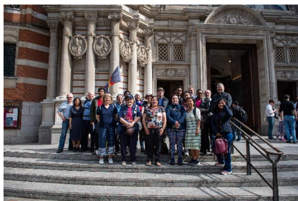
Justice and Peace Pilgrims at Westminster Cathedral Read the report on the Westminster Way Pilgrimage

A warm welcome to Pope Leo XIV from everyone involved in Westminster Justice and Peace. Our new Holy Father has sent a very clear message of his concern to promote Catholic Social Teaching in his choice of name, reaching back to Pope Leo XIII who began the modern era of CST with his 1891 encyclical 'Rerum Novarum – On the Rights and Duties of Capital and Labour'. We look forward to his leadership on the modern challenges that confront us in the formation of human societies, especially in areas such as the climate crisis, massive inequality in the distribution of wealth, and the rise of artificial intelligence.